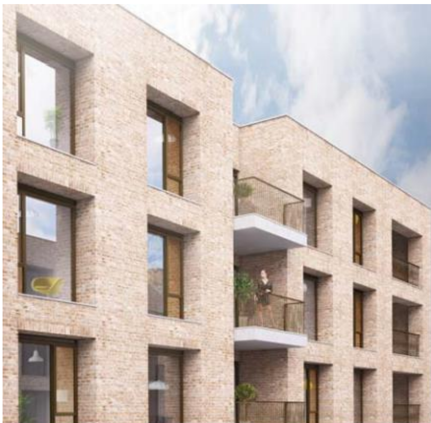
Bay Study image of Buildings 4 and 6