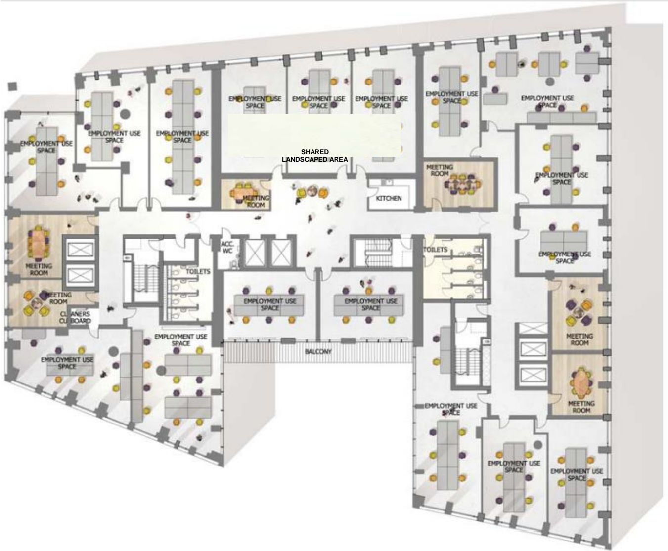
Building 1 and 2: Employment use typical level 3 as proposed