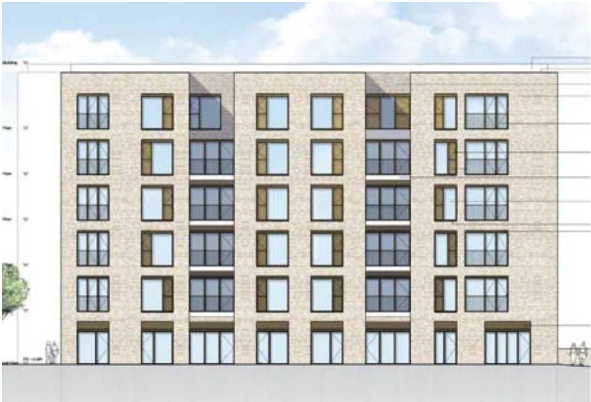
Building 4: Consented East Elevation