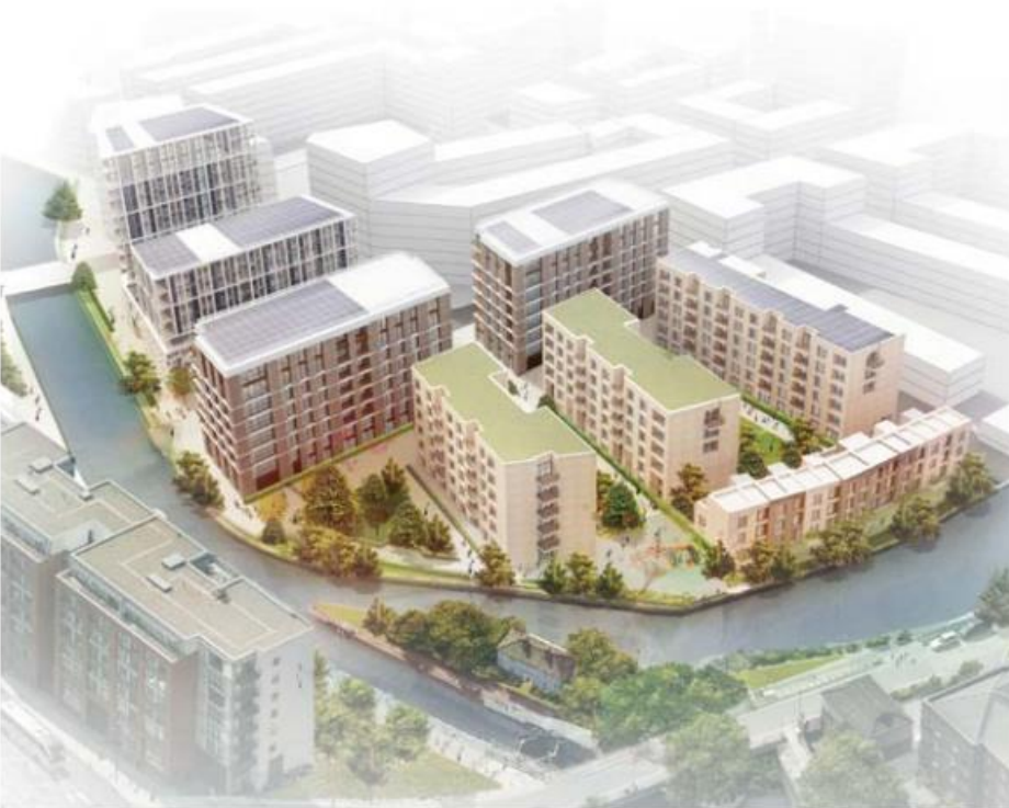
Aerial view of Consented Scheme