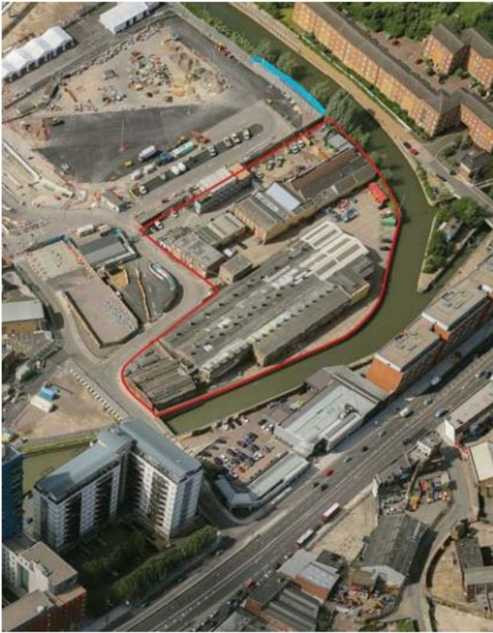
Aerial photo of Site