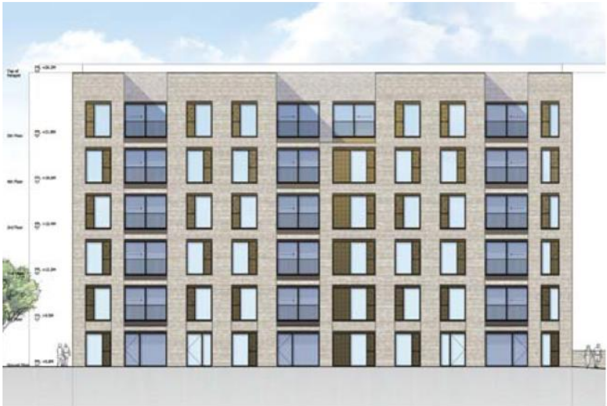
Building 4: Proposed East Elevation