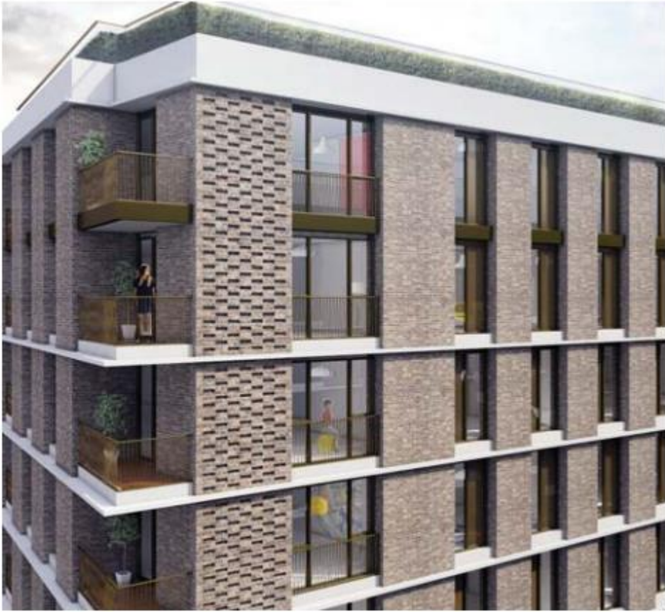
Bay Study image of Buildings 3 and 7