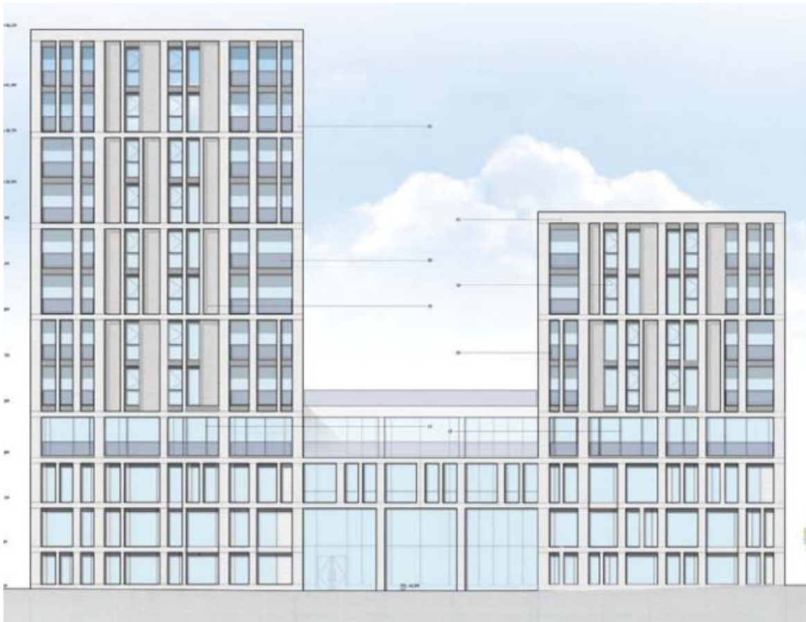
Building 1 and 2: Southern elevation as proposed