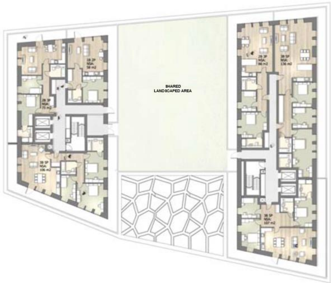
Building 1 and 2: Level 3 as consented