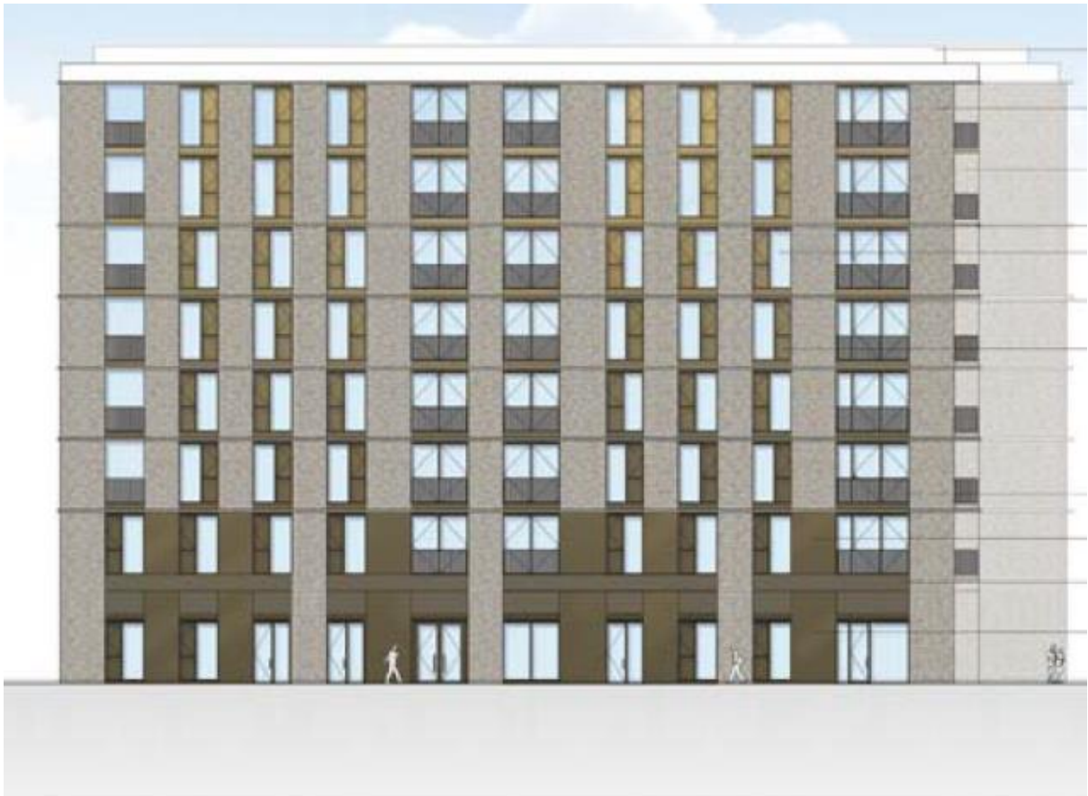
Building 7: Consented South Elevation