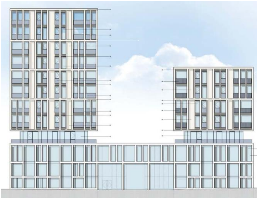
Building 1 and 2: Southern elevation as consented