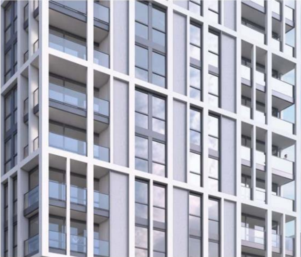
Bay study image of Buildings 1 and 2